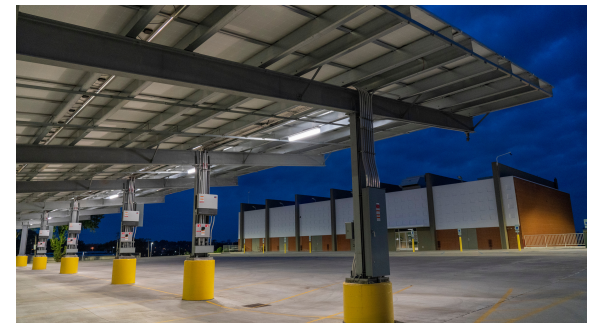
IBEW members are being trained to safely install the electric vehicle charging infrastructure necessary to support the expected EV boom.

IBEW is participating in an industry coalition to ensure only certified electricians are installing the electric vehicle charging network. The curriculum is called EVITP (the Electric Vehicle Infrastructure Training Program) and it seeks to standardize the buildout of the EV charging infrastructure.